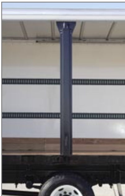
Rolling multi-positioned side posts