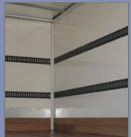
Optional E-track front and sidewall locations