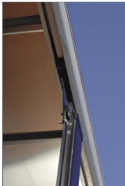
Rolling multi-positioned side posts